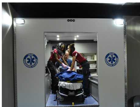
Emergency Medical Technician