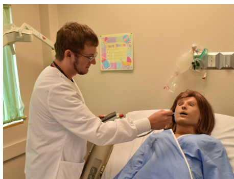
Certified Nursing Assistant